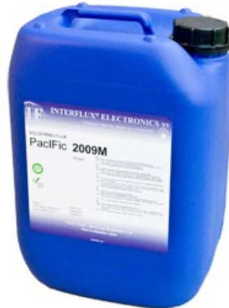
Products pictured may differ from the product delivered

PacFic 2009M allows a change-over from alcohol based fluxes to water based fluxes with absolutely no disadvantages.