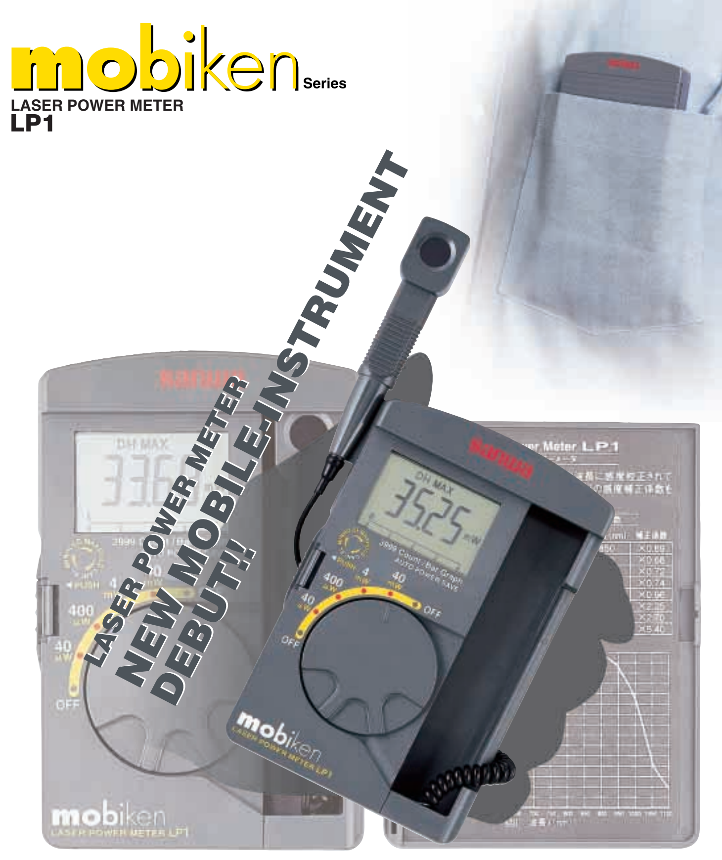
SIZE:177(H) X 76(W) X 18(D)mm Approx. 120g